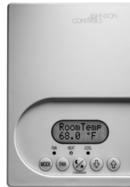
Figure 1: TEC21x6-2 Series N2 Networked Thermostat with Two Outputs, Dehumidification Capability, and Three Speeds of Fan Control

The TEC21x6(H)-2 Series Thermostats feature an intuitive user interface with backlit display that makes setup and operation quick and easy. The thermostats also employ a unique, Proportional-Integral (PI) time-proportioning algorithm that virtually eliminates temperature offset associated with traditional, differential-based thermostats.