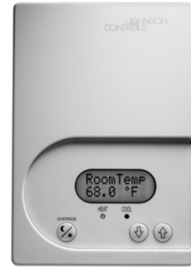
TEC21x7-2 Series N2 Networked Thermostat with Two Outputs