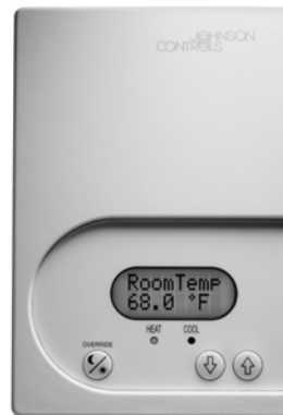
Figure 1: TEC21x7-2 Series N2 Networked Thermostat with Two Outputs

The TEC21x7-2 Series Thermostats feature an intuitive user interface with backlit display that makes setup and operation quick and easy. The thermostats also employ a unique, Proportional-Integral (PI) time-proportioning algorithm that virtually eliminates temperature offset associated with traditional, differential-based thermostats.